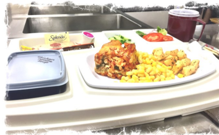
Straight off the menu—Home-made lasagna and soup of the day with your choice of veggies and home fried potatoes. Served fresh to you within

Nutrition and Food Services are continuing to work with staff and patients to make even more improvements to Room Service, and are hoping to have even less restrictions as to which patients qualify in the future. Currently there are 6 menu options for patients: Regular, Gluten Free, Controlled Carb, Renal, Low Fiber and Heart Healthy.