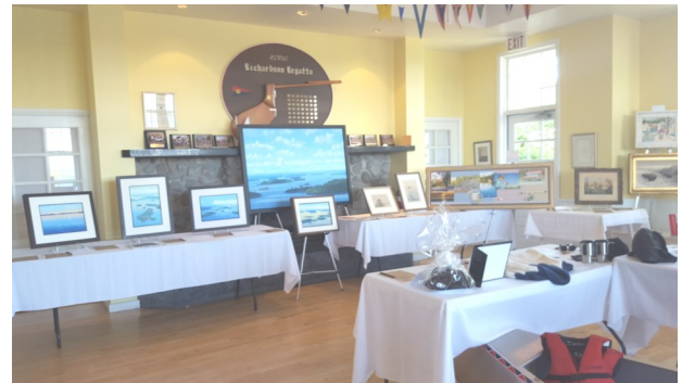
A peek at the Silent Auction (Above and Below). Thank you Scotiabank for your title sponsorship! (Bottom Left)