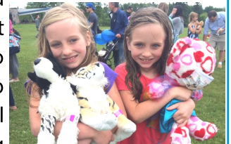
All patched up!

This past summer, Q104 invited LWDHF to be a part of their annual community BBQ! Saturday, June 20th was the Teddy Bear Picnic and Q-Munity BBQ at Anicinabe Park hosted by Q104/Kenora Online in support of LWDHF. We had a great time helping at the triage tent and loved seeing the amazing turnout from the community! Thank you to everyone who came by to say hello and ask us about your hospital foundation. We're already looking forward to next year's picnic!