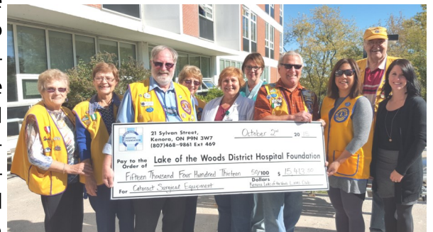
Thank You Kenora Lions Club for your support!

The Kenora Lake of the Woods Lions Club presented a donation to LWDHF in the amount of $15,413.50 for Cataract Surgery, a cause close to their hearts. The new cataract instruments will increase the efficiency of cataract surgeries, by always having the next patients' cataract instruments ready for when they are. This will allow for even more cataract surgeries to be done at your hospital! Without the tremendous financial support from the Kenora Lions Club, cataract surgeries would not be available in your community!