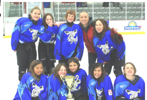
Top fundraising team for 2014—they raised $6,000 for your hospital!