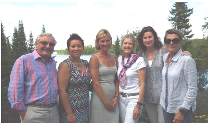
The Ladies & Gent of Lifesavers 2015

"Thank you so very much! The depth and breadth of your support is really beyond words. What we have been able to accomplish this year and over the past ten years is a testament to your generosity and your vision for the Lake of the Woods District Hospital. So once again many, many thanks."