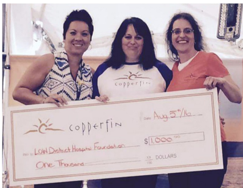
In support of the Ladies on the Lake event, Copperfin Credit Union generously matched pledges and donated $1,000 to support the Forms of Hope fund. Thank you Copperfin!

Thank you Ladies on the Lake for raising over $4,500 for the Forms of Hope fund!