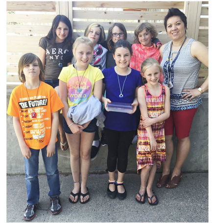
The Grade 4 SMB Flea Market raised $58.20 for your hospital!

Thank you Grade 6 Pope John Paul students and Grade 4 Saint Marguerite Bourgeoys! As part of their Entrepreneurial Projects, they hosted a flea market (right) and a pop-up restaurant (left) and chose to support LWDHF as one of the many great causes in our community! Congratulations on all of your hard work!