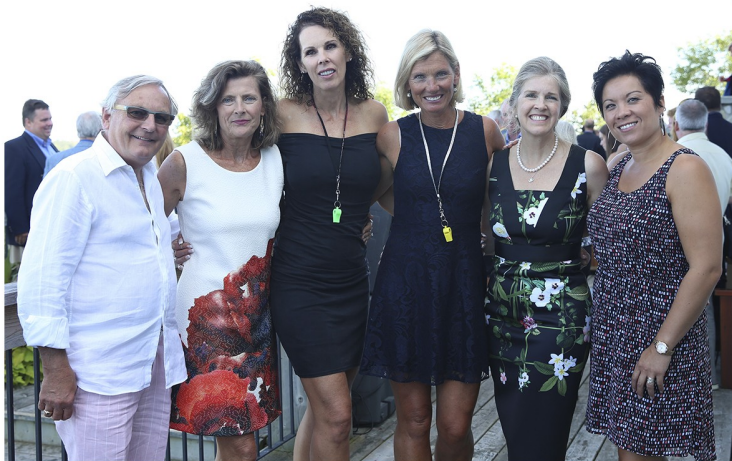
Lifesavers 2016 Committee (Left to Right)