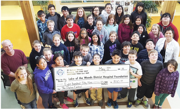
The Grade 6 PJP Italian Cardinal pop-up restaurant raised $850 for your hospital!

Thank you Grade 6 Pope John Paul students and Grade 4 Saint Marguerite Bourgeoys! As part of their Entrepreneurial Projects, they hosted a flea market (right) and a pop-up restaurant (left) and chose to support LWDHF as one of the many great causes in our community! Congratulations on all of your hard work!