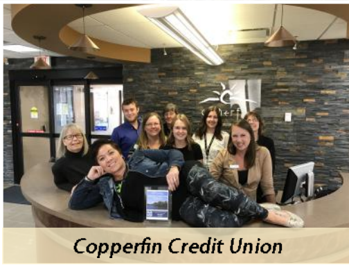
Copperfin Credit Union

This past fall, LWDHF surprised some of our amazing partners and delivered personalized plaques recognizing their significant contributions to the CT Scan Renewal Campaign and to the Dingwall Group for their part in bringing a wireless fetal heart monitor to your hospital.