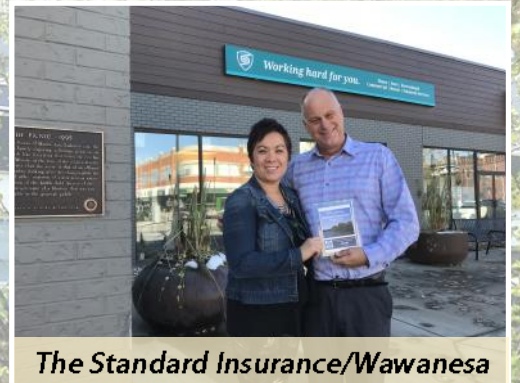
The Standard Insurance/Wawanesa