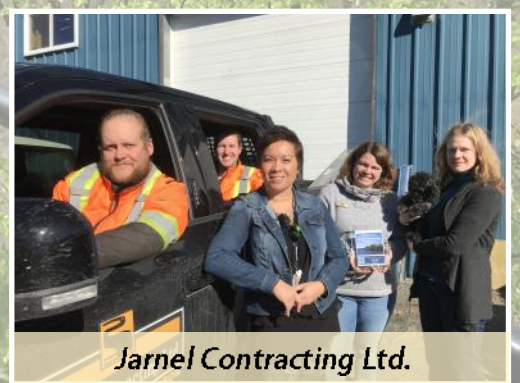
Jarnel Contracting Ltd.