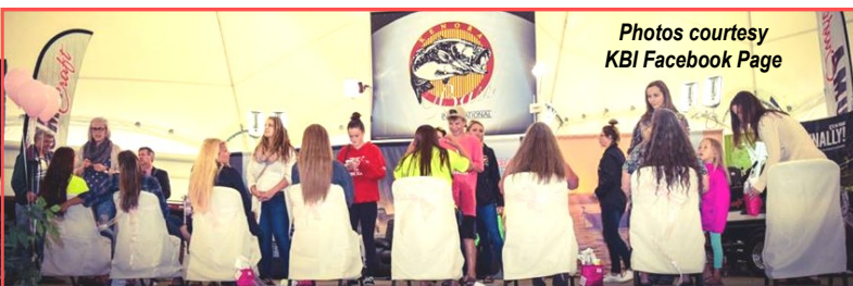
Volunteers on the stage cutting their hair to be donated into wigs.