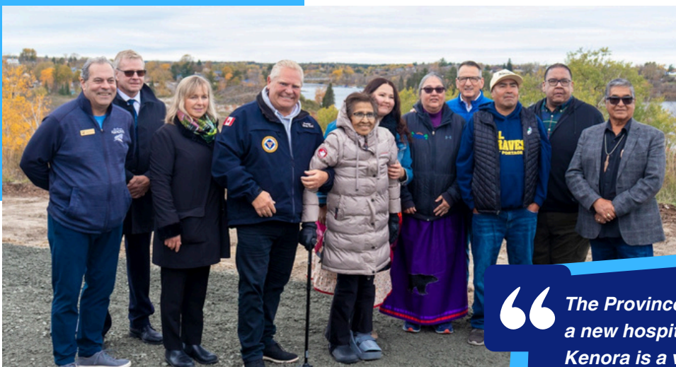
Ontario's Premier, Doug Ford visited 1060 Lakeview Drive, the future site of Kenora's new hospital and Wiigwas Elder and Senior Care