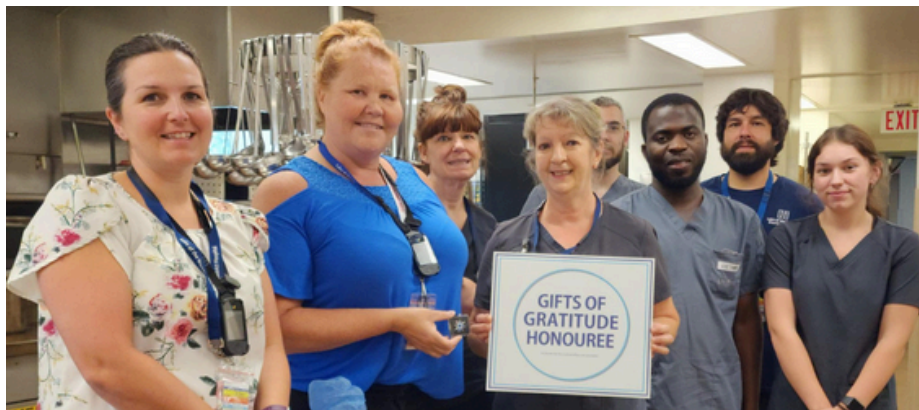
The Nutrition Services Team was honoured with a Gift of Gratitude in July.